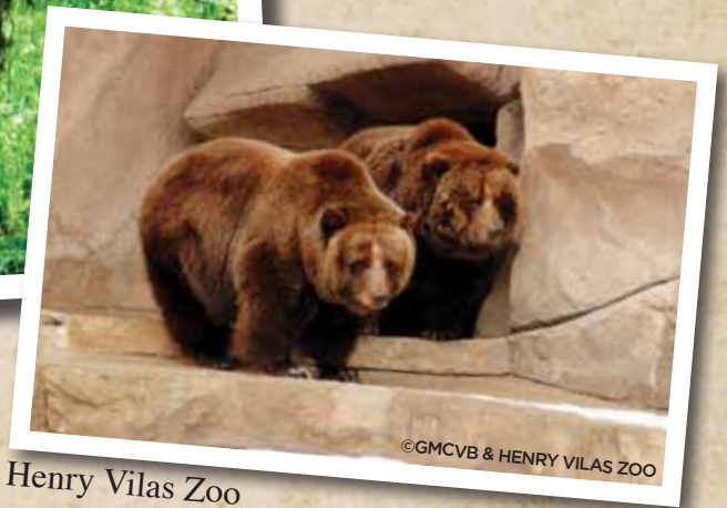
Henry Vilas Zoo