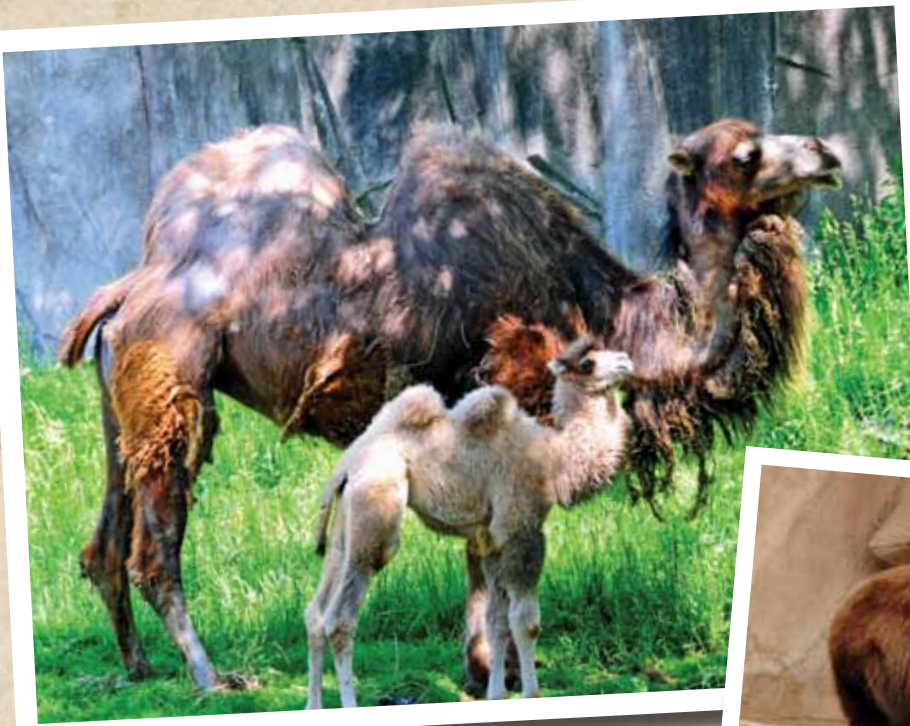
The Milwaukee County Zoo